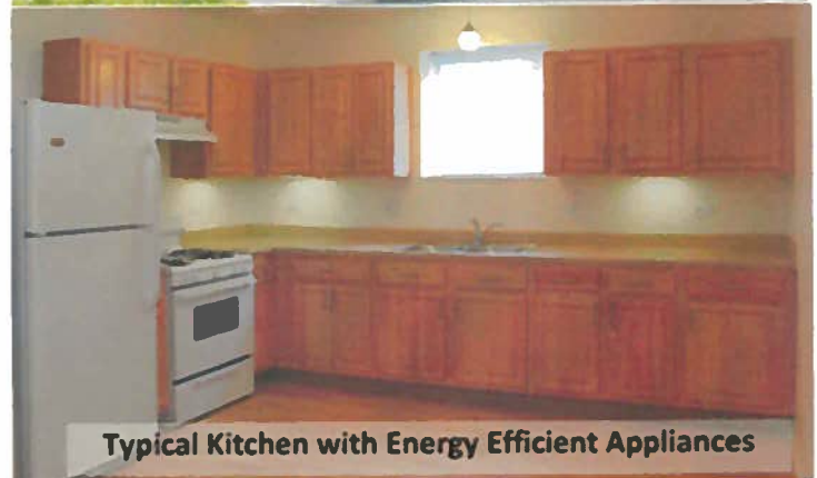
Typical Kitchen with Energy Efficient Appliances