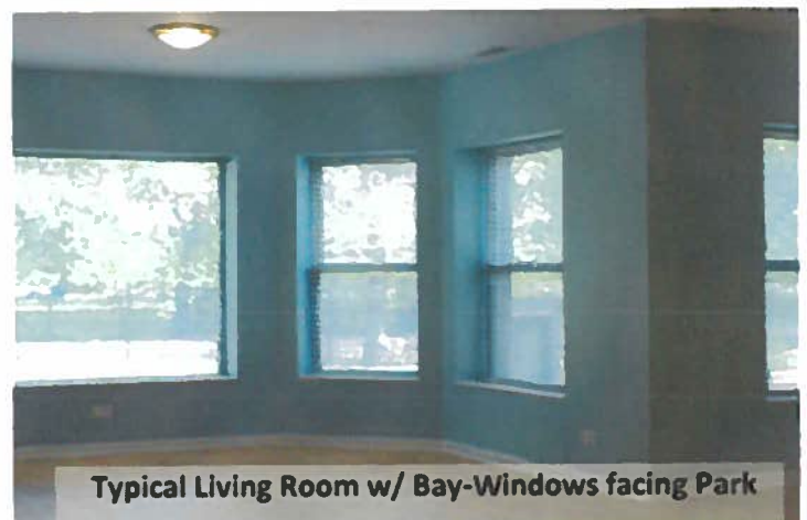
Typical Living Room w/ Bay-Windows facing Park