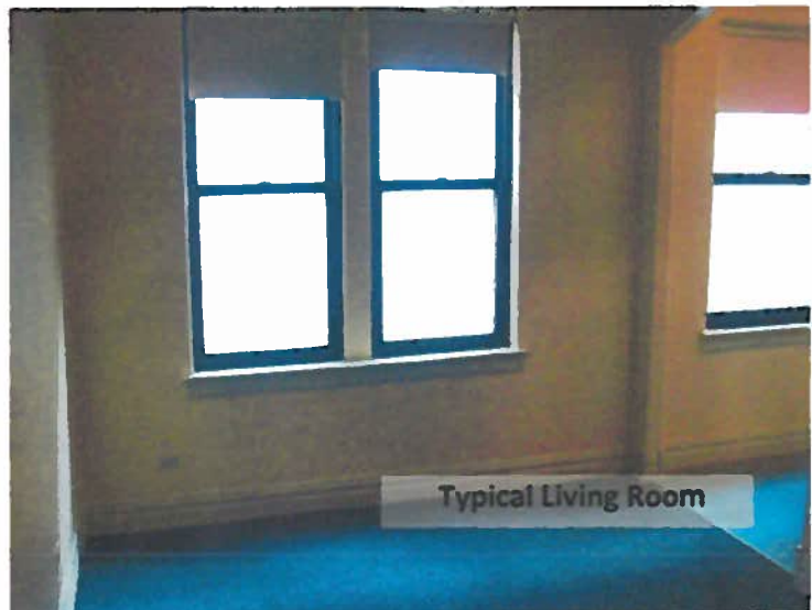
Typical Living Room